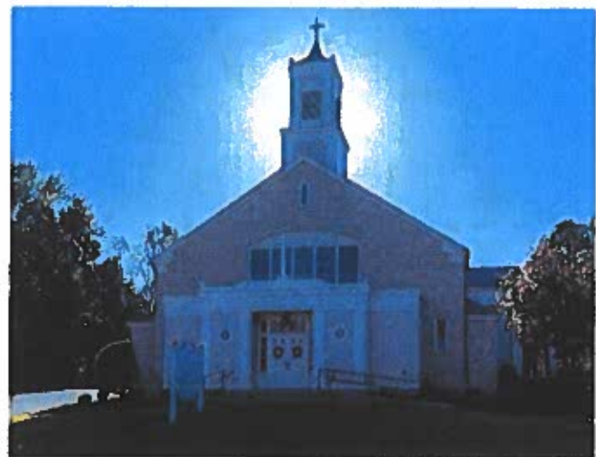
St. Zepherin Church